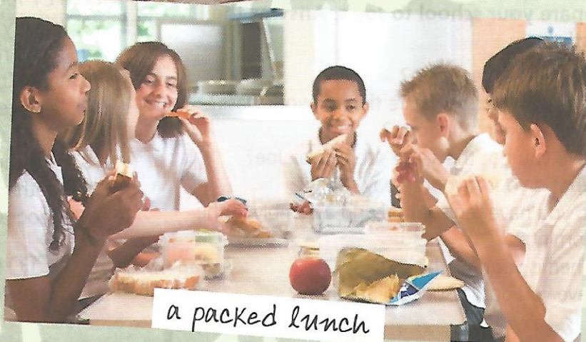
a packed lunch