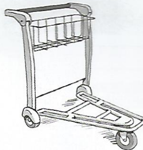
7 a _____ l _____