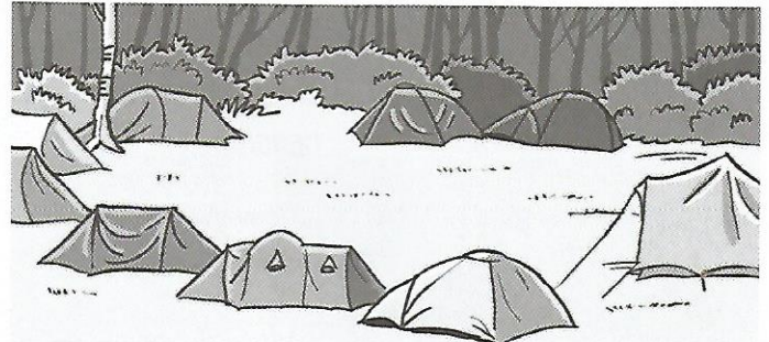
2 a _____ p _____