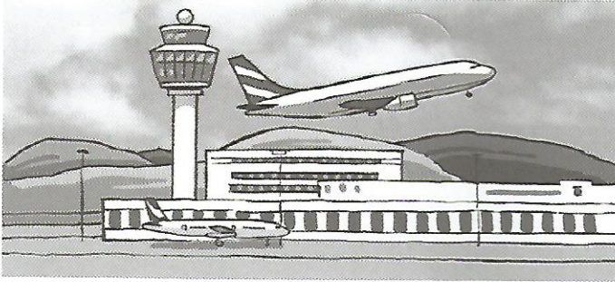
1 an a i r p o r t