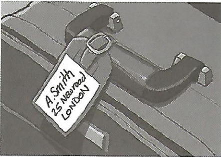
6 a _____ b _____