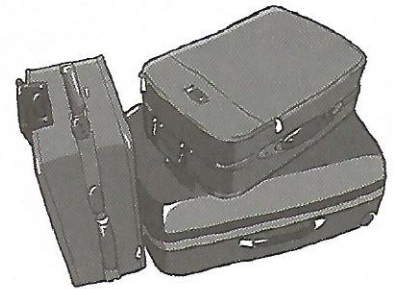
5 _____ g _____