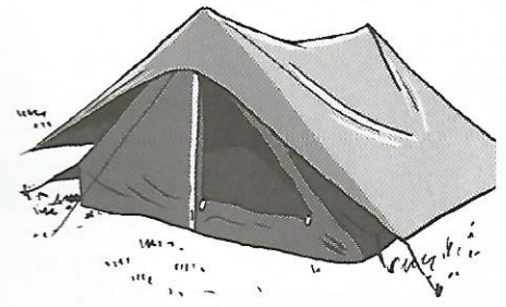
8 a _____ t _____